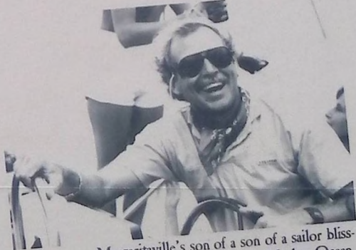
Margaritaville's son of a sailor blissfully steers a true course across Mother Ocean.