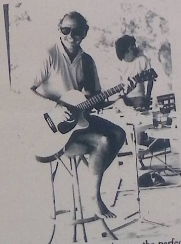
Jimmy and his guitar are the perfect partners for a lazy afternoon concert on a lush private island.

Yes, you can still order from Jimmy Buffett's Caribbean Soul T-shirt Line. Choose from the following designs: Cheeseburger in Paradise, Son of a Sailor, Changes in Latitude, Hurricane, Fins, Migration, One Particular Harbour, Margaritaville, and Why Don't We Get Drunk and Screw. All shirts are $12.95, and come in S, M, L, and XL. Please include $3.00 to cover the shipping and handling of your order.