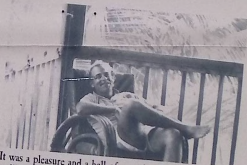
It was a pleasure and a hell of a weekend.. a smiling Jimmy recalls the good times he had showing the Parrot Heads his town.