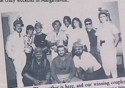
The weather is here, and our winning couples are certainly beautiful as they assume true Parrot Head garb.