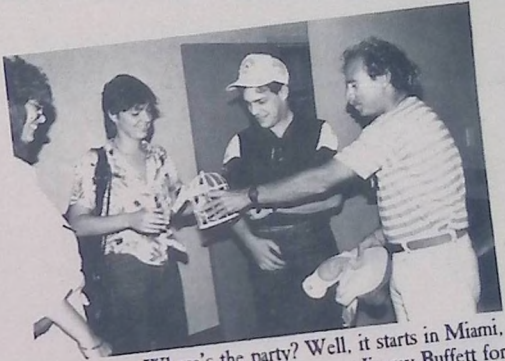
Where's the party? Well, it starts in Miami, as the lucky winners meet Jimmy Buffett for the first time.

But it seemed like such a shame that ALL the Parrot Heads couldn't join in the good times—so there's The Coconut Telegraph's Christmas present to you: a look at the photo highlights of that crazy weekend in Margaritaville.