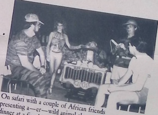
On safari with a couple of African friends presenting a—er—wild animal show during dinner at a fine local restaurant.