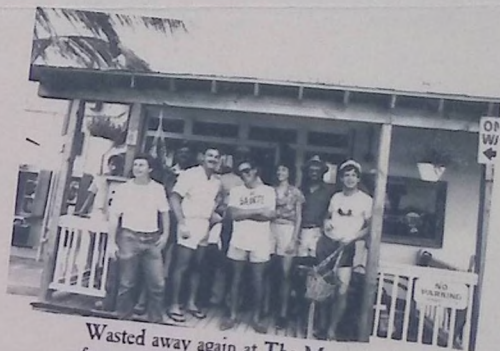
Wasted away again at The Margaritaville Store after a wild shopping spree and photo session—complete with Bloody Marys.