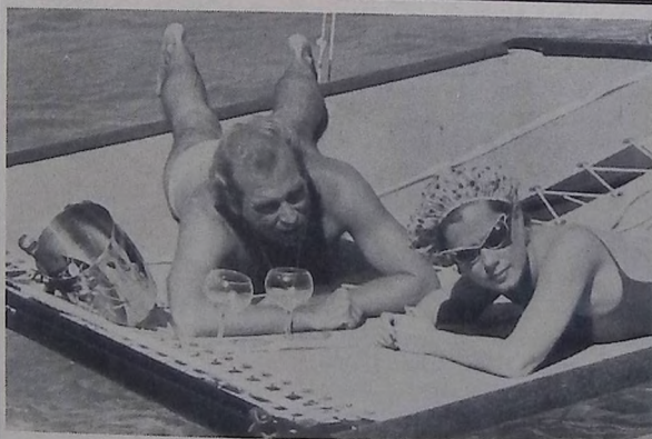
WHO ARE THESE BLONDE STRANGERS?

ahead. We love getting mail from Parrot Heads.